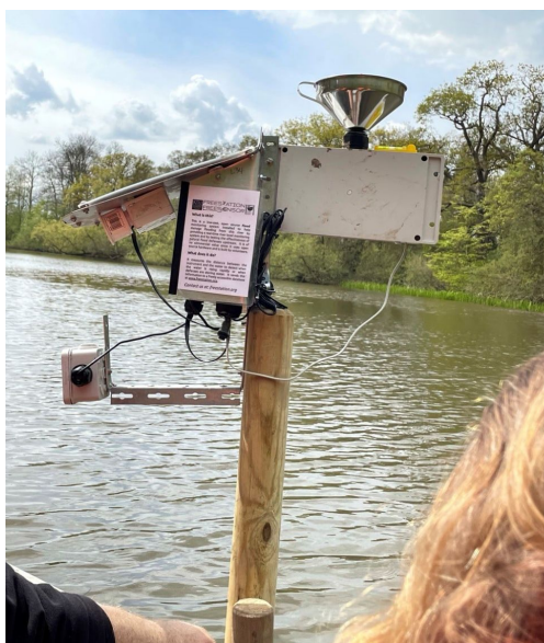
Natural Flood Management