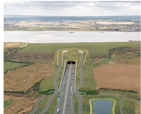
New transport infrastructure