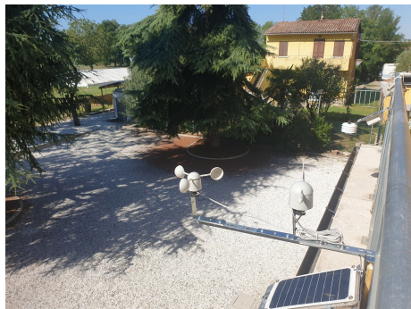
Urban greening for urban heatwave planning