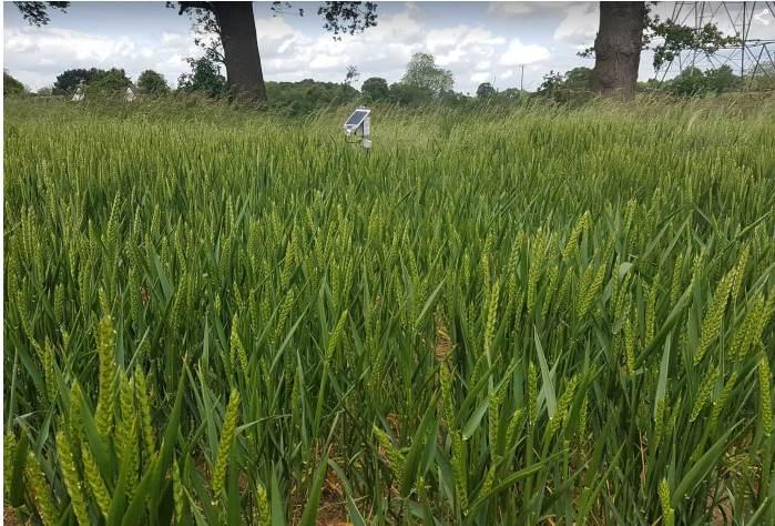
Regenerative agriculture monitoring

ReSET gathered Environmental Intelligence to assess how to achieve the triple win of economic, environmental and employment benefits in green recovery investments - such as Regenerative Agriculture. We studied investments in the Thames Gateway, OxCam Arc and London and the Duero river basin in Spain