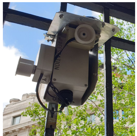
Air and Noise Pollution