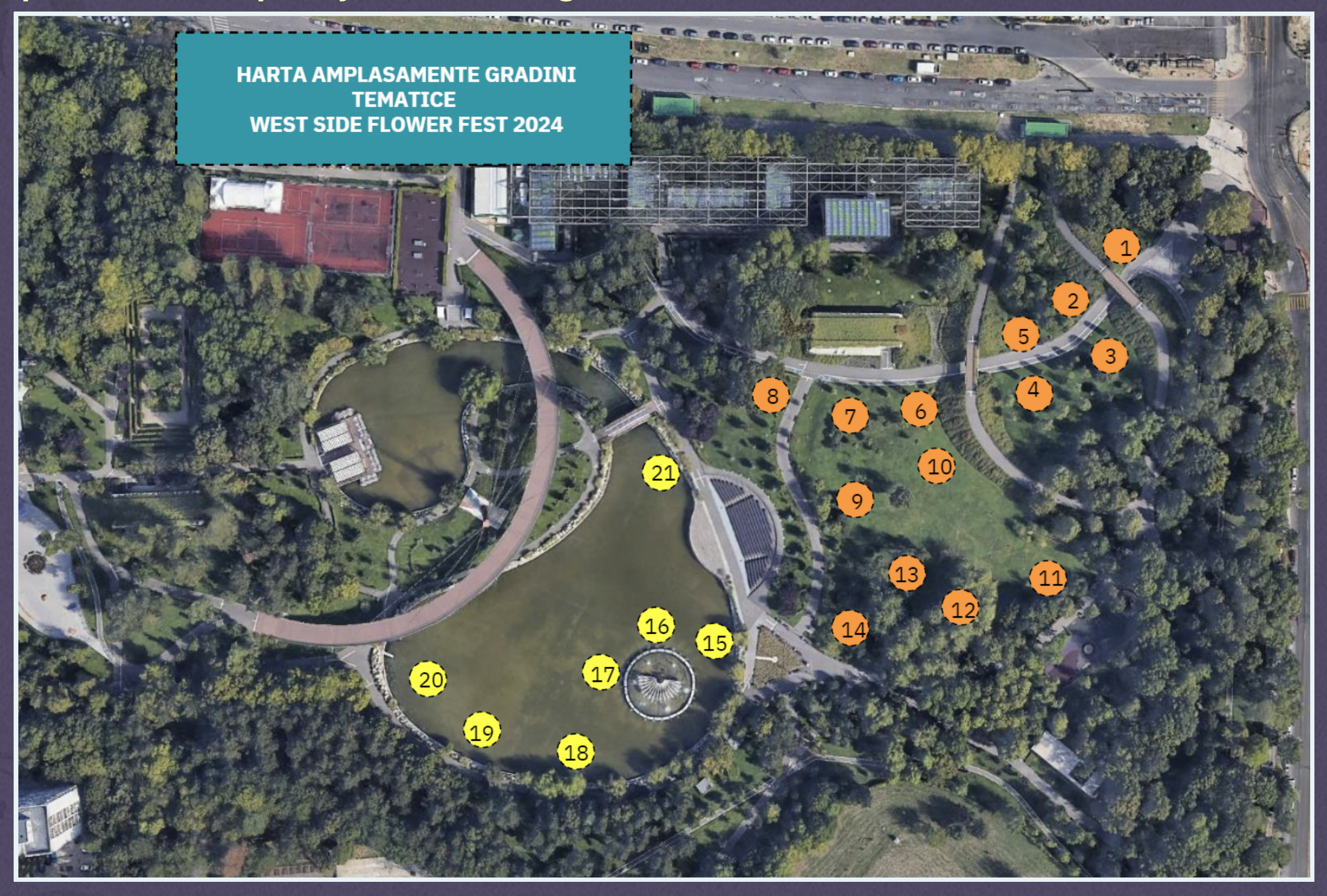
Map of the event – Drumul Taberei Park

The sustainable use of water in public urban spaces and the improvement of quality of life through nature